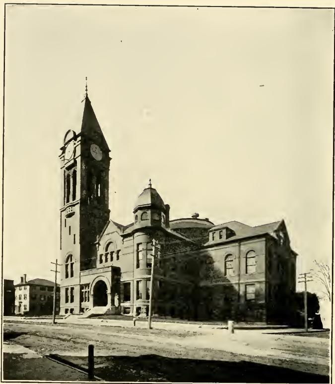
CITY HALL, DOVER, N. H.