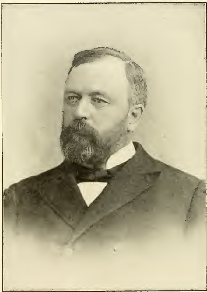
HON. CHARLES HENRY SAWYER.